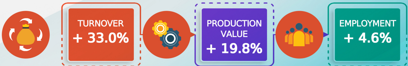
PRODUCTION VALUE BY SECTORS